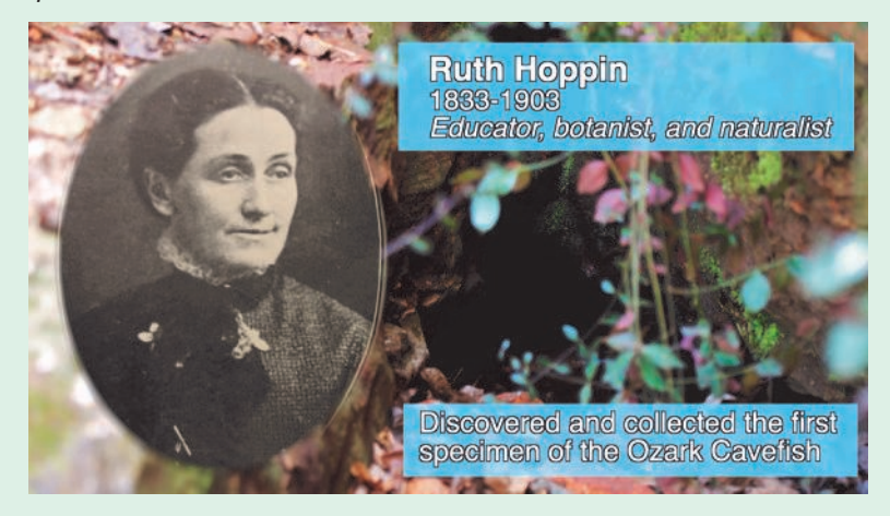
View the new video about naturalist Ruth Hoppin and her 1880s discovery of the Ozark cavefish in Sarcoxie Cave.

https://www.facebook.com/OzarkRegionalLandTrust/ videos/1037831929573144/