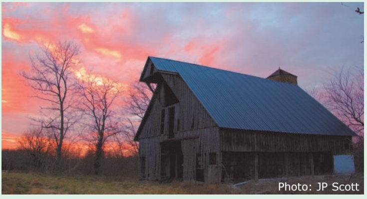
Above: Built around 1892, this barn is part of a state-recognized century farm. The farm and surrounding 300 acres west of Springfield, MO, is permanently protected from urban development.