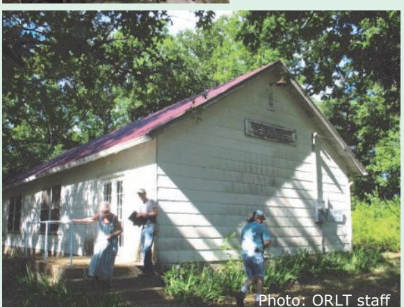
Above: Oak Hill Grange in Eureka Springs, AR, was built in 1956 to serve as a community building. ORLT now owns and protects it and the 27 surrounding acres.

Left: Dovetailed corners on this 1935 cabin at William Woods Nature Preserve, left, are a factor in its nomination to the National Register of Historic Places. The privately owned 560 acre preserve is in Madison County, AR.