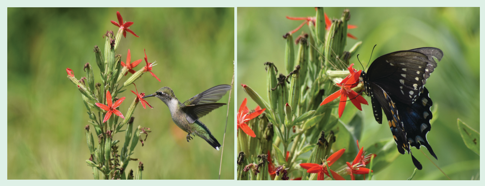
Photos: Facing page, above and below, show the variety of native plants and the birds and butterflies that they attract.

These results suggest that active management of urban prairie units may be enough to sustain the same level of pollinator services as rural prairies. The fact that there is great heterogeneity in native plant species between/across both urban and rural prairies is, I think, a positive.